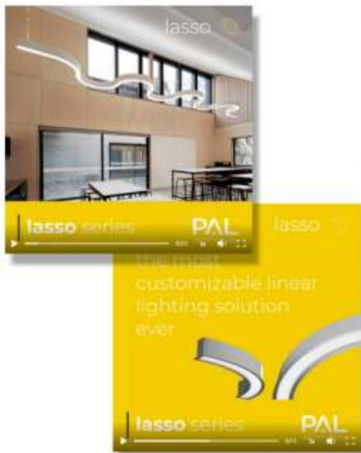
Social media assets