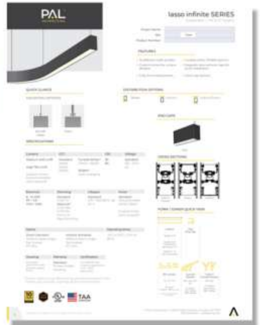
Spec sheet / data sheet